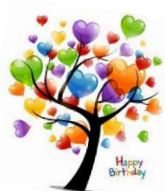
Illustration by Pippa